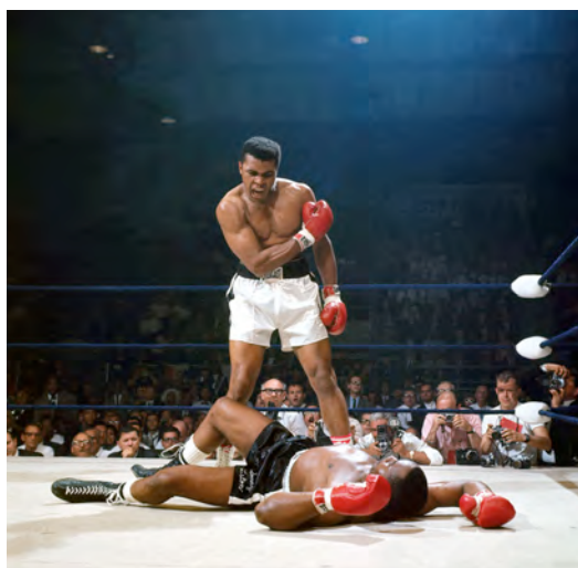
"Muhammad Ali Knocks out Sonny Liston" May 25, 1965

During the four-month exhibit, the free IRIS Nights lecture series will continue to be held inside the space on Thursday evenings. Expected speakers include Iooss, Leifer, notable athletes, sports commentators and others. Additional programs related to the exhibit will include a children’s photography contest, a themed group slideshow evening, photography workshops and a family event to be held the Saturday prior to Super Bowl Sunday, 2010. Details and final schedules will be announced later this Fall.